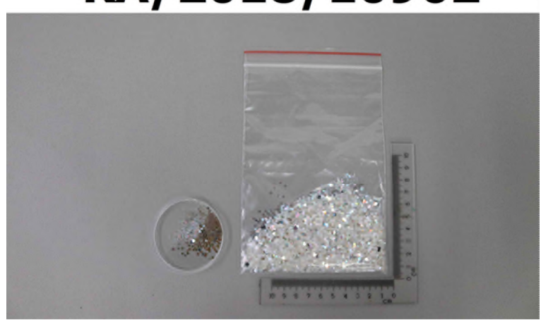
** 報告結尾(End of Report) **

Unless otherwise stated the results shown in this test report refer only to the sample(s) tested. This test report cannot be reproduced, except in full, without prior written permission of the Company.除非另有說明,此報告結果僅對測試之樣品負責。本報告未經本公司書面許可,不可部分複製。 This document is issued by the Company subject to its General Conditions of Service printed overleaf, available on request or accessible at <a href="www.sgs.com/terms">www.sgs.com/terms</a> and <a href="conditions.htm">conditions.htm</a> and, for